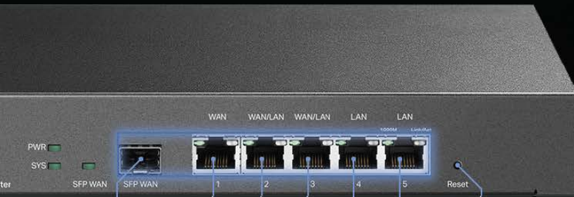
Gigabit VPN Router

1x Gigabit SFP WAN Port 1x Gigabit WAN Port 2x Gigabit WAN/LAN Port 2x Gigabit LAN Port Reset